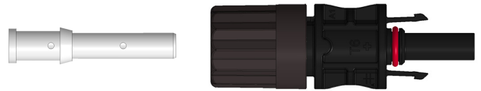
Female connector (+)