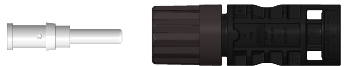
Male connector (-)